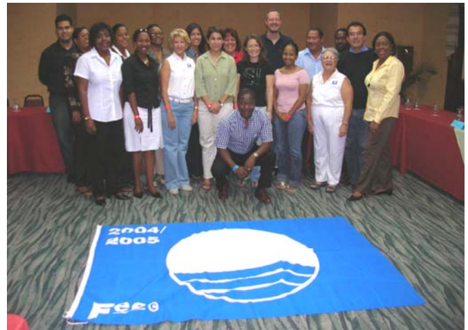
Group photo of the Blue Flag Workshop