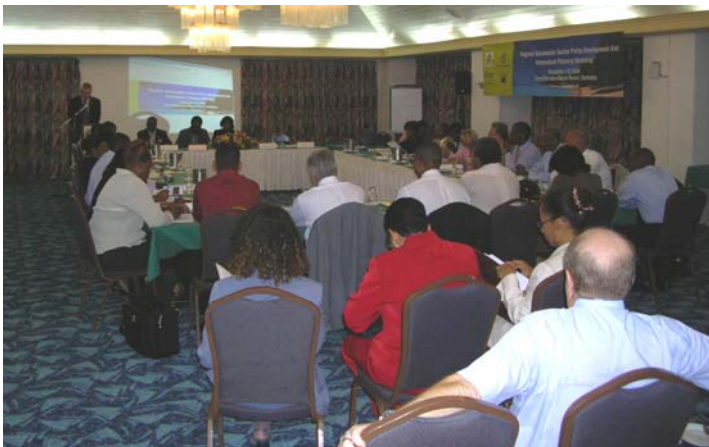
Participants at the STDP Workshop