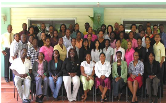
Tourism Statistics Workshop Group Photo

All of the CARIFORUM member states were invited but only twelve were represented at the workshop, with the Dominican Republic, Haiti and St. Vincent & the Grenadines not sending representatives. The non-CARIFORUM Caribbean countries represented were Bermuda, British Virgin Islands, Curacao, Montserrat, Puerto Rico, St. Maarten and Turks & Caicos.