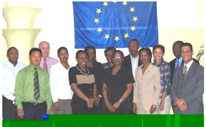
Group Photo of the Policy Review Board

Several key decisions were made during the course